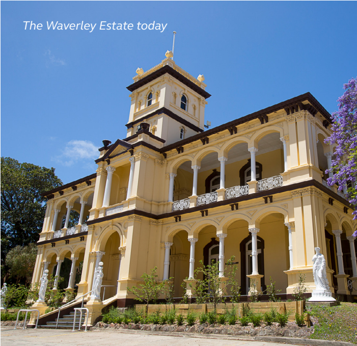
The Waverley Estate today

We greatly value the heritage of Uniting Waverley and recognise the great service it provides to the local community.